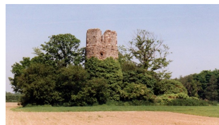
The remains of St Mary's Church, Fleggburgh.