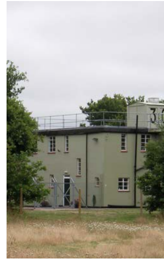
Martlesham Heath Control Tower