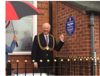
Jem Mace Plaque

The Society erects blue plaques around the district to commemorate buildings, people and events of local interest.